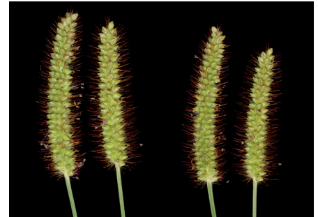
➡ Close up of the Yellow Bristle Grass.

throughout the districts, as well as local Weedbusters staff and other regional contractors.