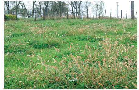
➡ Paddock infested with Yellow Bristle Grass.

In order to know the full extent of Yellow Bristle Grass spread on the West Coast, it is important that farmers ensure they are familiar with the plant, and actively look for it on their property and the adjoining roadside. It is likely that Yellow Bristle Grass was brought into the region in feed purchased from another Region, so checking around hay sheds and anywhere else feed has been stored is a good starting point. To reduce any potential roadside distribution, mowing contractors have been shown the plant and will be keeping an eye out while they complete their work programme